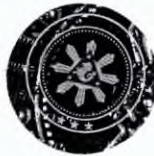
RODRIGO ROA DUTERTE President of the Philippines