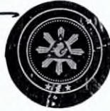
RODRIGO ROA DUTERTE President of the Philippines