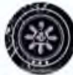
RODRIGO ROA DUTERTE President of the Philippines