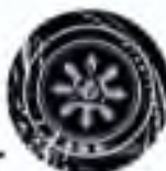
RODRIGO ROA DUTERTE President of the Philippines