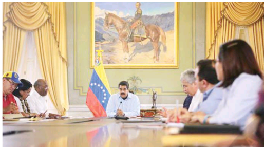
Venezuela's President Nicolas Maduro (center) speaks during a meeting with ministers at the Miraflores Palace in Caracas, Venezuela May 12, 2016.

access hard currency to buy raw materials. Maduro accuses Polar and others of trying to destabilize the financially stricken country by exacerbating shortages of goods from foodstuffs to medicines to toilet paper. Meanwhile dueling anti- and pro-government crowds demonstrated in Caracas on Saturday for and against a bid to recall the president. Maduro opponents demanded that the National Electoral Council rule on the validity of some 1.8 million signatures collected in favor of the referendum and allow it to move forward. "If you obstruct the democratic way, we do not know what could happen in this country," opposition leader Henrique Capriles said at one rally. "Venezuela is a bomb that could explode at any moment." Across town, Maduro ally Jorge Rodriguez vowed there would be no recall referendum. "They got signatures from dead people, minors and undocumented foreigners," Rodriguez said. Opposition leaders deny any fraud in the signature drive. Friday's decree extended for 60 days Maduro's exceptional powers to address the crisis. Venezuela is suffering from multiple financial woes including rampant inflation and low prices for oil, the cornerstone of its economy. Opposition leaders accuse Maduro and his predecessor, the late President Hugo Chavez, of mismanaging the economy. Maduro alleges that conservative political interests are waging what he calls an "economic war" seeking his ouster.