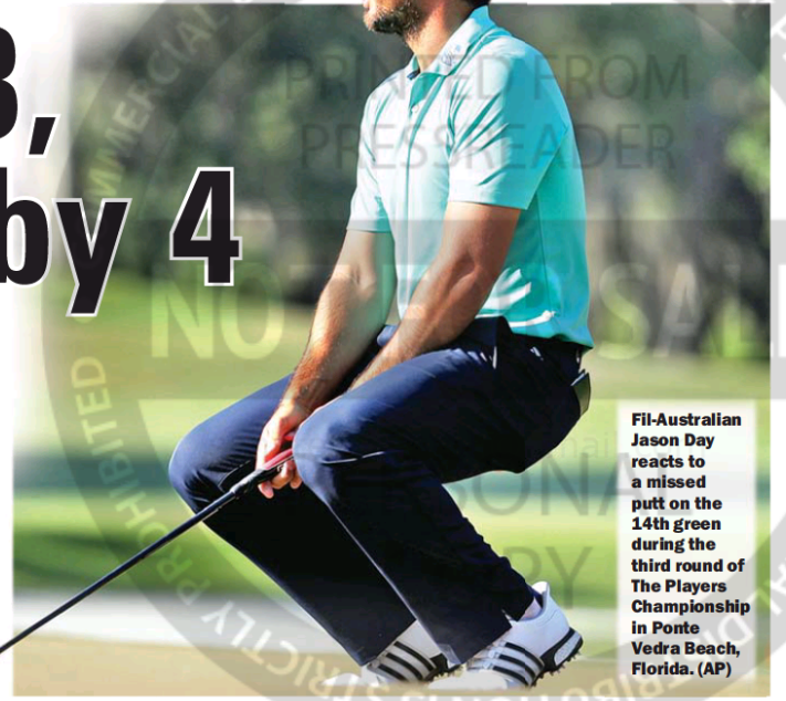
Fil-Australian Jason Day reacts to a missed putt on the 14th green during the third round of the Players Championship in Ponte Vedra Beach, Florida.

Japan's Hideki Matsuyama, Germany's Alex Cejka and American Ken Duke shared second on 206 with Italy's Francesco Molinari on 207. South African Retief Goosen and American Kevin Chappell shot 70 to reach 208.